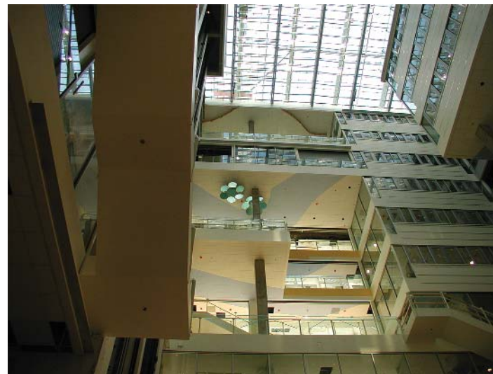
The Genzyme Corporation's recently completed office in Cambridge is a world-class example of green building construction, including advanced daylighting and thermal technologies. In addition to a photovoltaic installation funded by MTC, one of the most prominent features is a combined heliostat and reflective panel system designed to channel daylight deep into the 8-story building.

Green building energy savings primarily come from reduced electricity purchases and secondarily from reduced peak energy demand. On average, green buildings are 28% more efficient than conventional buildings and generate 2% of their power on-site from photovoltaics (PV). (See Figure 2.) The financial benefits of 30% reduced consumption at an electricity price of $0.08/kWh are about $0.30/ft 2 /yr, with a 20-year NPV of over $5/ft 2 , equal to or more than the average additional cost associated with building green.