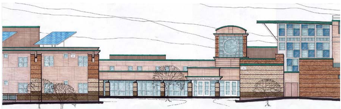
The Blackstone Valley Vocational Regional School District is planning an ambitious 80,000 square foot addition to accommodate four new vocational programs, and will renovate the existing building which has some systems that date back to the 1960's. Daylighting will be accomplished in this project by using light tube technology, which will save over 500 kW a year. Other efficiency measures include efficient air conditioning equipment and variable speed drives for the air handling unit. The school will also incorporate photovoltaic panels mounted on the roof and a solar thermal domestic water preheating system.

Given the studies and data reviewed above, the Report recommends attributing a 1% productivity and health gain to Certified and Silver level buildings and a 1.5% gain to Gold and Platinum level buildings. These percentages are at the low end of the range of productivity gains for each of the individual specific building measures—ventilation, thermal control, light control and daylighting—analyzed above. They are consistent with or well below the range of additional studies reviewed in the Report.